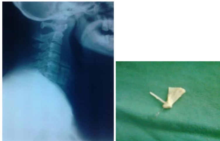
Fig. 2 Foreign body in the esophagus (left), fish bone removed from airway (right)

laryngeal foreign bodies of 2.5 % without considering oesophageal foreign bodies [7]. In Mulago National Referral Hospital in Uganda, ingested foreign bodies are a common occurrence in the ENT department though the actual prevalence is unknown [8]. A retrospective review of records from the same hospital between 1993 and 1999, reported 240 bronchoscopies performed to remove aspirated foreign bodies which averages approximately 40 bronchoscopies per year [Awubwa, Unpublished observation]. Therefore, a prevalence of 6.6 % at MRRH is high, and may be explained by the fact that MRRH serves a much larger population than its catchment area as it is the only regional referral hospital in South Western Uganda