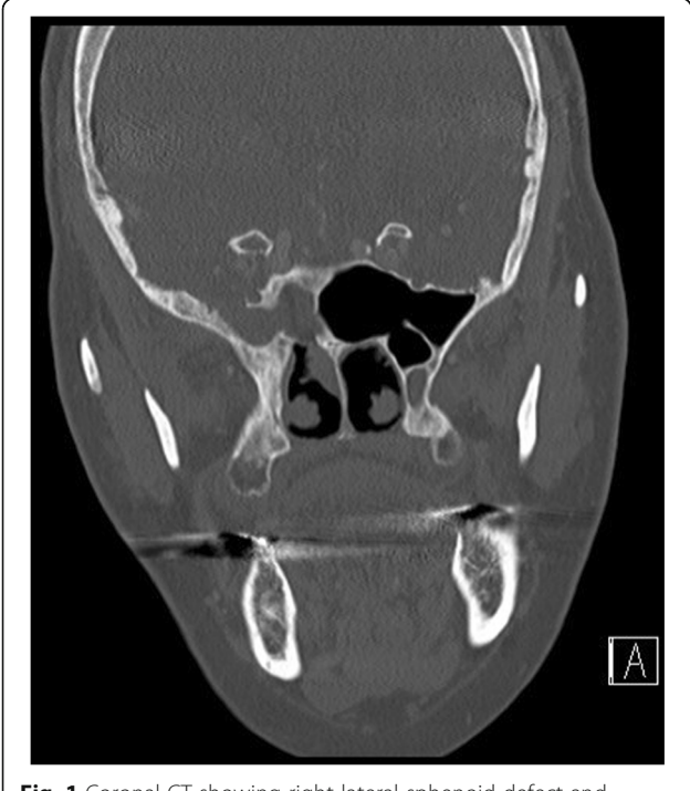
Fig. 1 Coronal CT showing right lateral sphenoid defect and encephalocele in patient #5

The aim of this study was to analyze a series of seven patients who underwent endoscopic repair of lateral sphenoid encephaloceles diagnosed and treated between 2012 and 2017, and to examine the relationship between success rate and method of surgical repair. Figure 1 shows a coronal CT image illustrating a right lateral sphenoid encephalocele in patient #5. All patients were operated on by a single author at a tertiary care regional hospital. All patients underwent transnasal transsphenoidal endoscopic repair of a lateral sphenoid encephalocele. In all cases the lateral sphenoid encephalocele was widely exposed using an extended transsphenoidal approach (with removal of the posterior maxillary sinus wall and reflection of the pterygopalatine fossa contents inferiorly when necessary for exposure) and then reduced/ excised using bipolar cautery until the defect was flush with the dura. Figure 2 shows the right lateral sphenoid encephalocele in patient #5 after wide sphenoidotomy and bipolar cauterization of the lateral sphenoid encephlocele. During exposure of the lateral sphenoid encephalocele the rescue flap modification of the nasoseptal flap was used to preserve the nasoseptal flap pedicle when an ipsilateral nasoseptal flap was utilized [3–5]. The nasoseptal