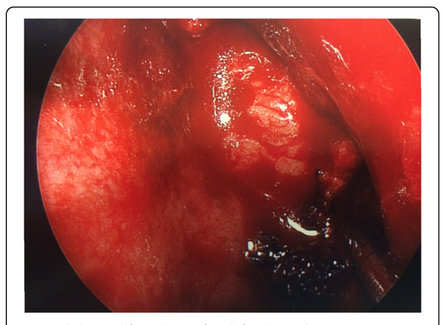
Fig. 3 Abdominal fat onlay graft in left sphenoid in patient #4

flap was otherwise elevated and inlaid in the standard fashion [6]. Patient 1 underwent repair using an Alloderm (Lifecell/Kinetic Concepts, Inc., San Antonio, Texas) inlay/ abdominal fat onlay/contralateral nasoseptal flap. Patient 2 underwent repair using Alloderm onlay/contralateral nasoseptal flap. Patient 3 underwent repair with an ipsilateral middle turbinate free mucosal onlay graft. Patients 4-7 underwent repair with Alloderm inlay/abdominal fat onlay/ ipsilateral nasoseptal flap. Figure 3 shows the abdominal fat onlay graft in place in patient #4, while Fig. 4 shows the ipsilateral nasoseptal flap in place overlying the abdominal fat graft in patient #4. Patients were instructed to avoid lifting >25 pounds for 6 weeks post-operatively and all repairs were bolstered with Surgicel (Ethicon, Inc., Somerville, NJ), Duraseal Sealant (Integra Lifesciences Corporation, Plainsboro, NJ), and Nasopore (Stryker, Kalamazoo, Michigan). Patients 1 and 3 had lumbar drains placed intraoperatively by a Neurosurgeon and were drained at 10 ml per hour for 48 h, clamped for 24 h, and then had the drains removed after 72 h total. Odds ratio